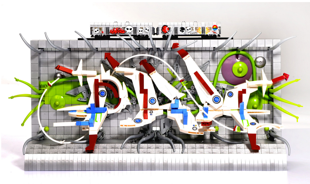
"PAX NYC Style" by Orion Pax

AS: When it serves the creations and creators need and it's not rule-bending within any contest or LEGO groups..... Actually I don't even care as long the creation looks cool it could even be glued cut bent flamed grilled nuked naked or send to moon and back ;) #