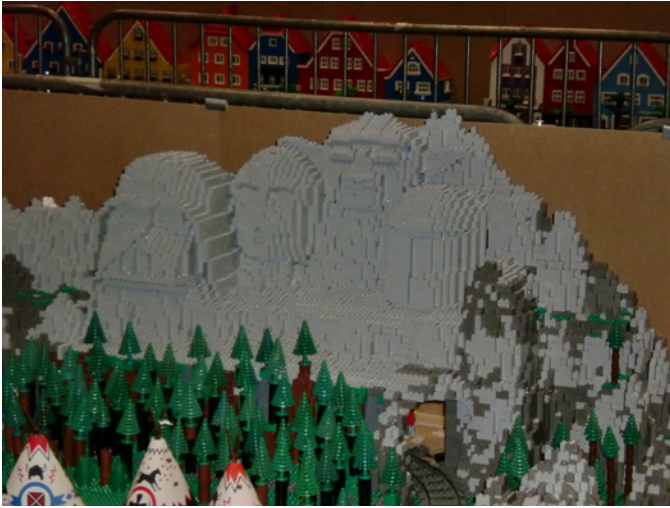
details of a factory, from the production area to the offices and the rest area.

HispaBrick Magazine® was also represented with the already well-known Castellers and also a model of the Sagrada Familia by Gaudi at Architecture scale. Hand luggage doesn't allow for carrying too many LEGO® models, but I couldn't imagine attending an event without showing any models, small as they might be, if the rules of the event made it possible.