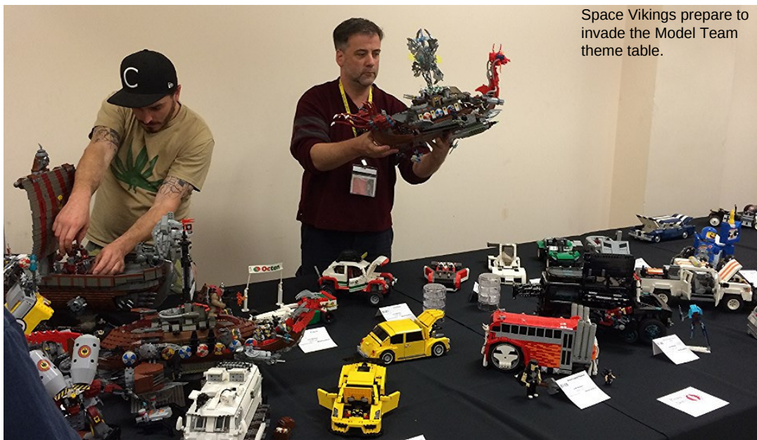
Space Vikings prepare to invade the Model Team theme table.

Some of the Invasions were quite creative in their reach and scope. The fearsome Space Vikings (along with their respective builders) invaded more than one theme over the course of the convention. Wearing Viking hats and playing battle music, the group of builders grabbed their Space Viking ships to go on a conquest of the Model Team car display.