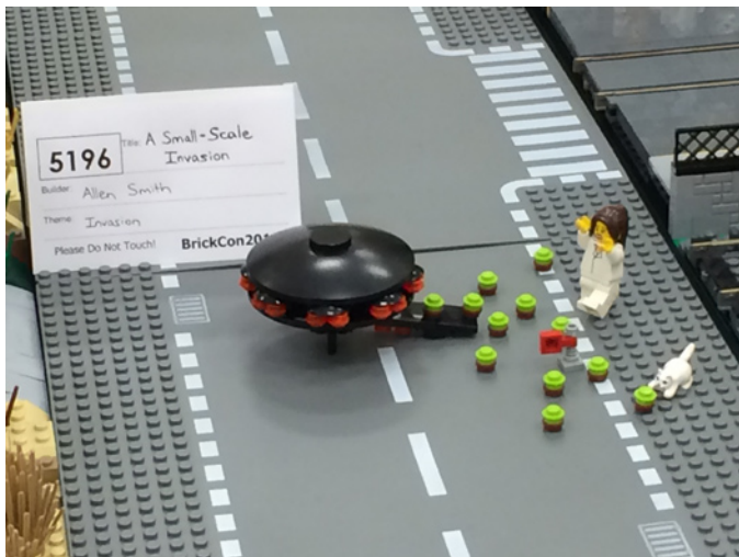
"A Small-Scale Invasion", by Allen Smith

In contrast to the large-scale battles waged throughout the exhibition hall, there were quite a few small invasions too. In "A Small-Scale Invasion" by Allen Smith, the invaders are no larger than mice, much to the delight of the neighborhood cat. And sometimes, the invading force might be something as cute and cuddly as a sheep going for a joyride on someone else's model, as was the case with Thorin Finch's sheep popping up in all sorts of different places, such as on the "Sun Salamander" by Sean and Steph Mayo.