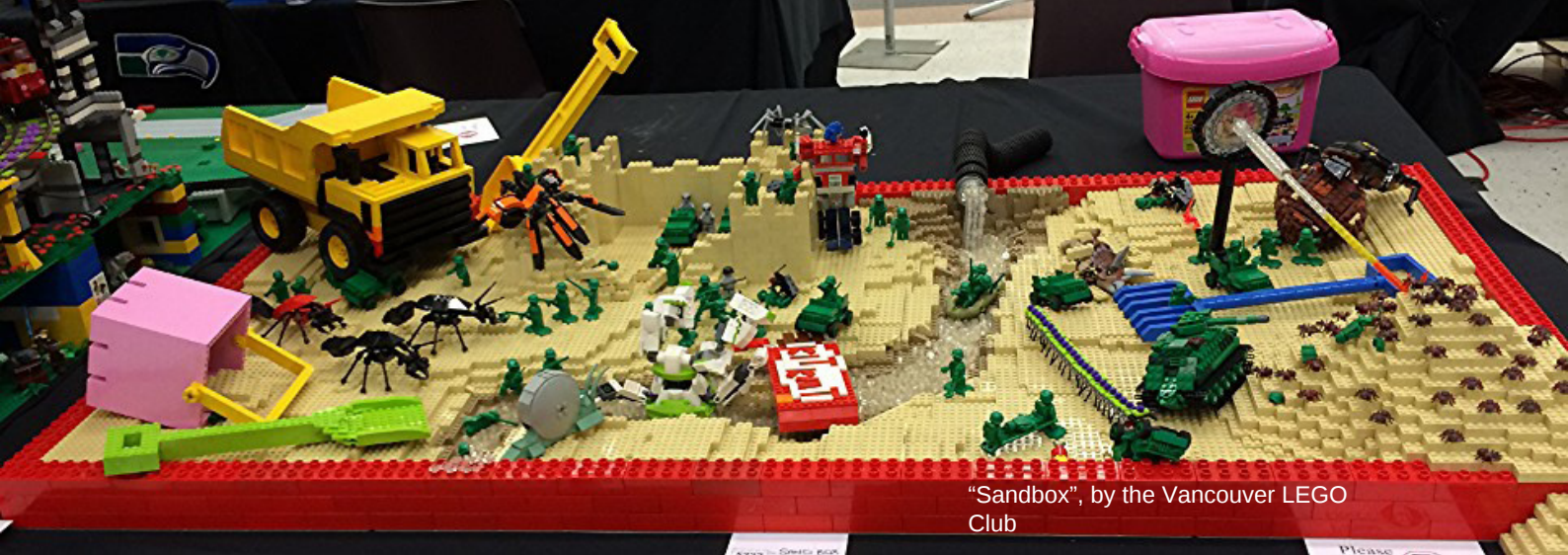
"Sandbox", by the Vancouver LEGO Club

In contrast to the large-scale battles waged throughout the exhibition hall, there were quite a few small invasions too. In "A Small-Scale Invasion" by Allen Smith, the invaders are no larger than mice, much to the delight of the neighborhood cat. And sometimes, the invading force might be something as cute and cuddly as a sheep going for a joyride on someone else's model, as was the case with Thorin Finch's sheep popping up in all sorts of different places, such as on the "Sun Salamander" by Sean and Steph Mayo.