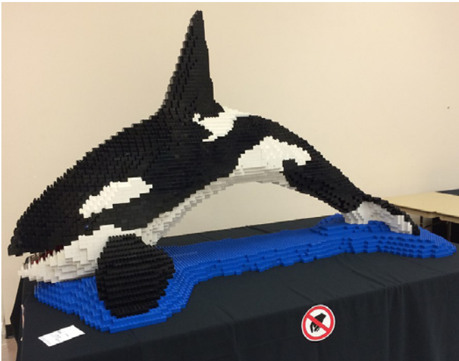
Blackberry, the giant LEGO orca, by Robin Sather

BrickCon 2014 returned to the Seattle Center in Seattle, Washington, for its 13th year. This year 470 convention attendees showed up with their models of all different shapes and sizes, from giant space needles and DUPLO orcas, to teeny-tiny replicas of actual models for the micro-BrickCon display.