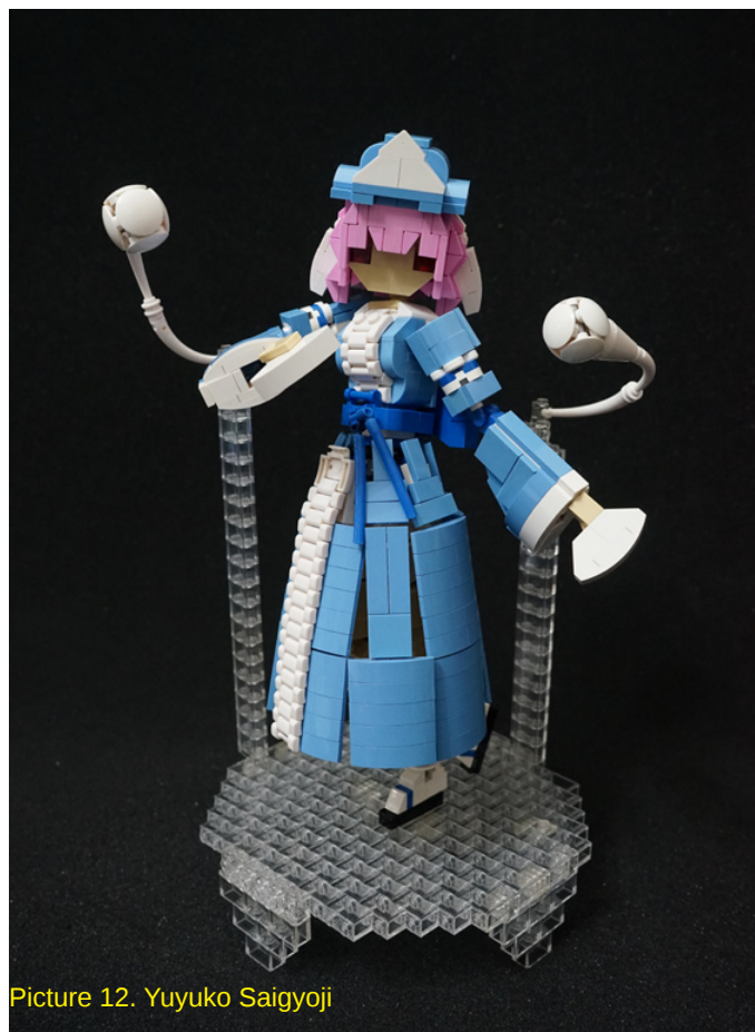
Picture 12. Yuyuko Saigyoji