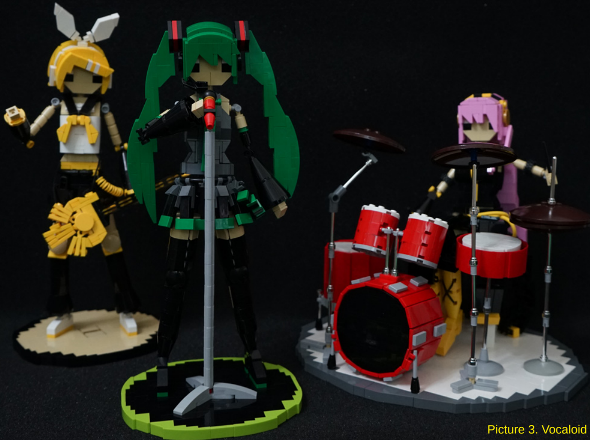
Picture 3. Vocaloid Band

figurine, I tried to use different skill to make them perfect. As you can see in picture 3 and 4, different costumes are made in different ways. Luka, the one with pink hair, has the more difficult costume since there is a yellow line on her cloth. I used a technic wedge belt wheel part to sketch the curve of upper body. The one with yellow hair, Rin, who wears shorts, is somehow easier to build. By using technic joint parts, she could move like a real person. The last one, with lime hair, Gumi, is a newer one in my works. As more kinds of LEGO® bricks are released, I could build the hair smoother.