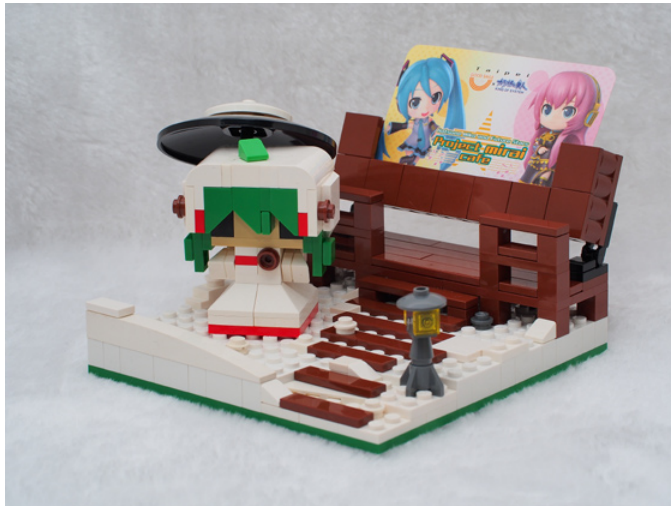
Picture 1. Snow Miku in mini scaling.