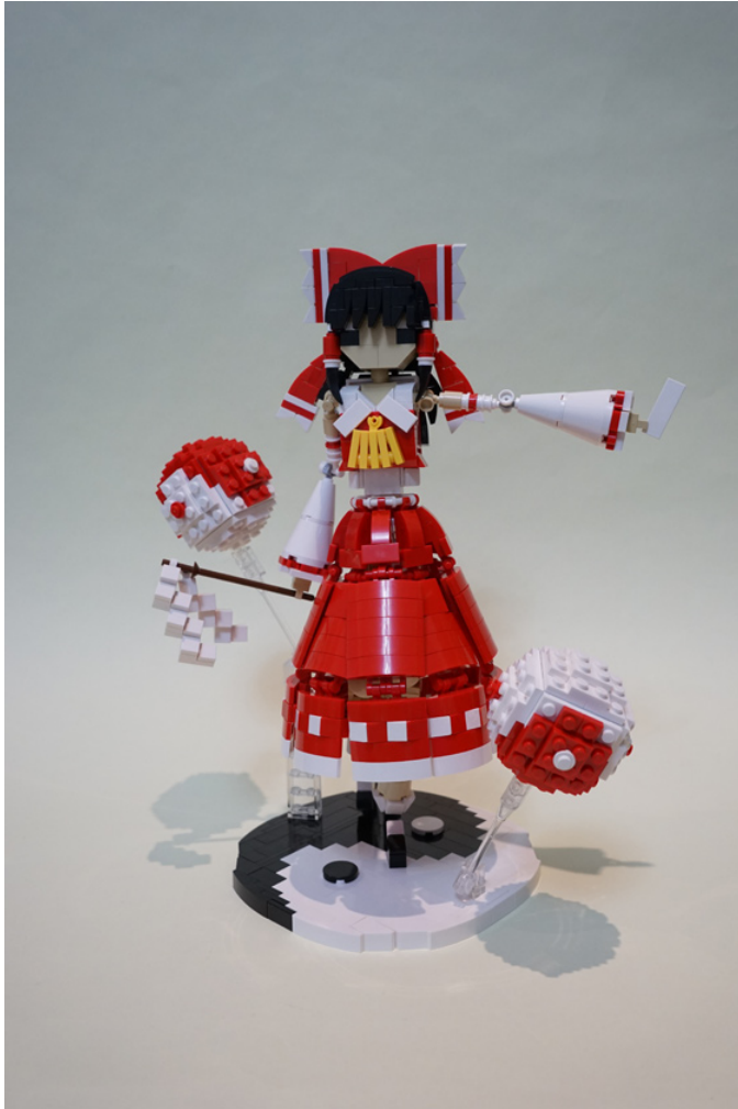
Picture 14. Shimakaze