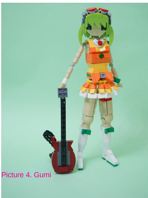
Picture 4. Gumi

"SNOW MIKU" festival has been held every winter since 2010. I have built 2013, 2014, and 2015 snow Miku, and I will build all snow Miku in the future! 2013 snow Miku was designed to wear a white kimono. In picture 5 you can see that I used a new way to present the kimono. The main theme of 2014 snow Miku was "Magical Girl". In picture 6, you can see the cute costume, and since every magical girl needs a pet, there is special pet by her side. In this year, the costume is themed "SNOW MIKU x Plants". I spent lots of time constructing the costume. It is hard to build a shawl with bricks in such a scale. After trying many times, I finally found a way to present it properly.