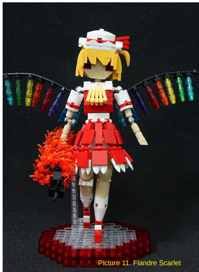
Picture 11. Flandre Scarlet