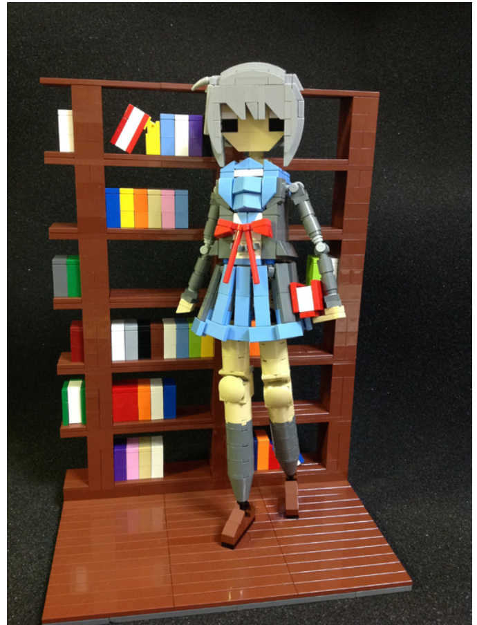
Picture 9. Nagato Yuki

The second is Nagato Yuki. She is from anime "The Melancholy of Haruhi Suzumiya", which is the first anime I watched, so it is meaningful for me. If I didn't watch this anime, I would never build creations like this. In this work, I used a mudguard part to present the collar of the uniform. Since the character likes reading book, I built an appropriate scene for her: the library corner.