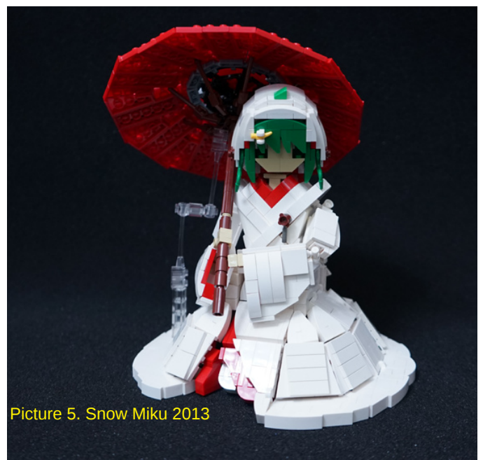
Picture 5. Snow Miku 2013