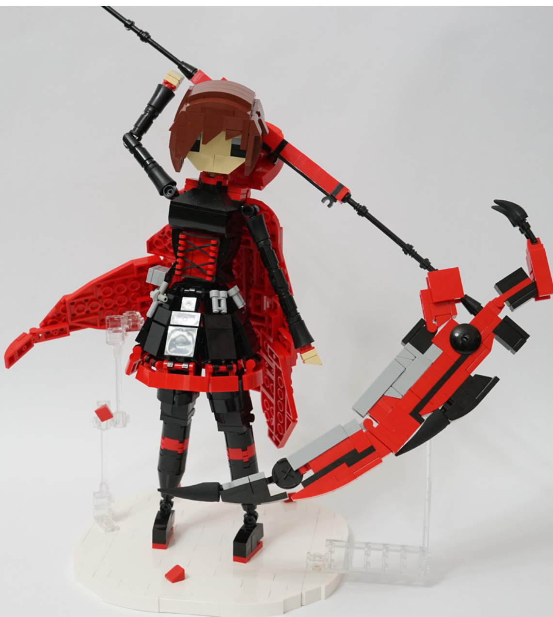
Picture 19. Ruby Rose