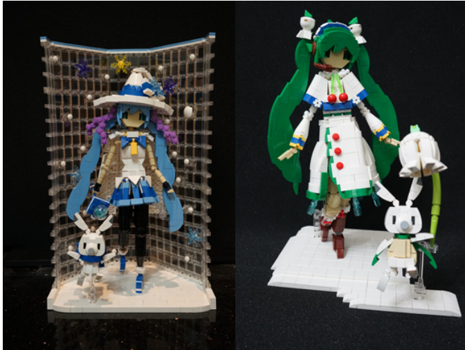
Picture 7. Snow Miku 2015