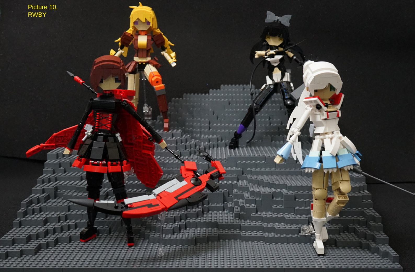
Picture 10. RWBY