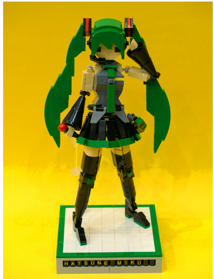
Picture 2. Hatsune Miku

My first figurine is a 1/7 scaled version of Hatsune Miku, who is a humanoid persona voiced by a singing synthesizer application developed by Crypton Future Media. As a virtual singer, she has a great amount of fans from the entire world, and I am one of them. Deeply addicted to her songs, I tried to build my own LEGO Miku. After two weeks, I finally completed it and posted the photos on my flickr account. Fortunately some LEGO brick lovers saw my MOC and gave me a lot of positive feedback, thus I decided to build the next one.