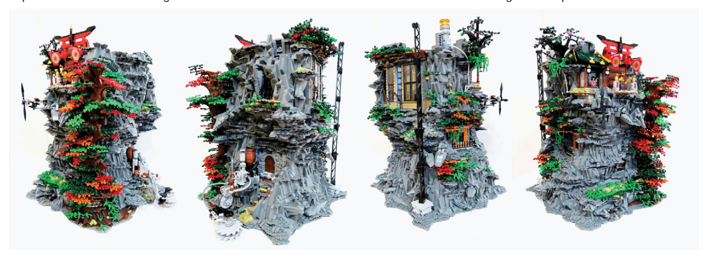
HBM: What plans do you have for future builds?

I spend a lot of time observing MOCs on Flickr. I think I'm not an inventor/creator but rather a good 'compiler'.