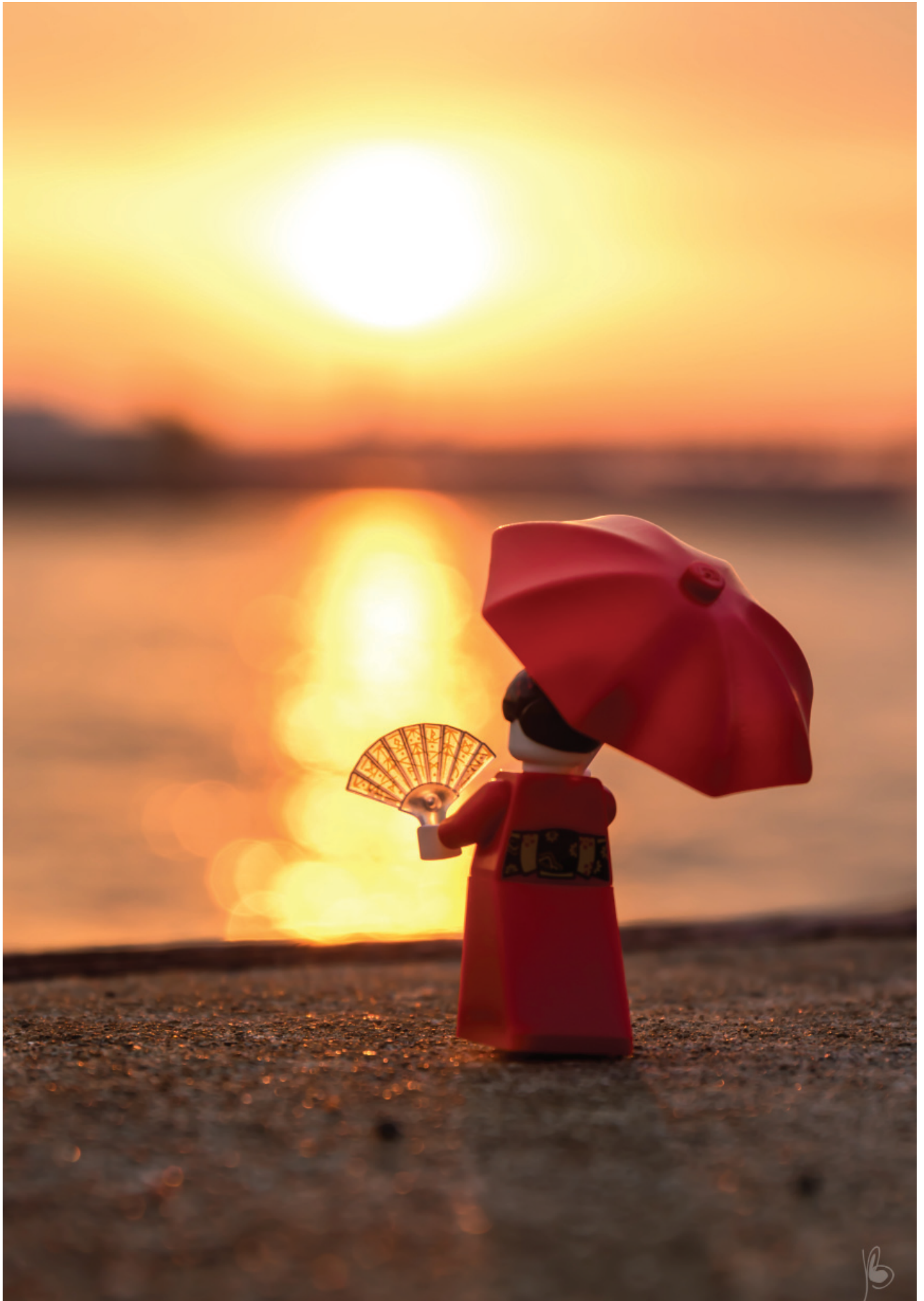
Kimono girl at sunrise by Ballou34