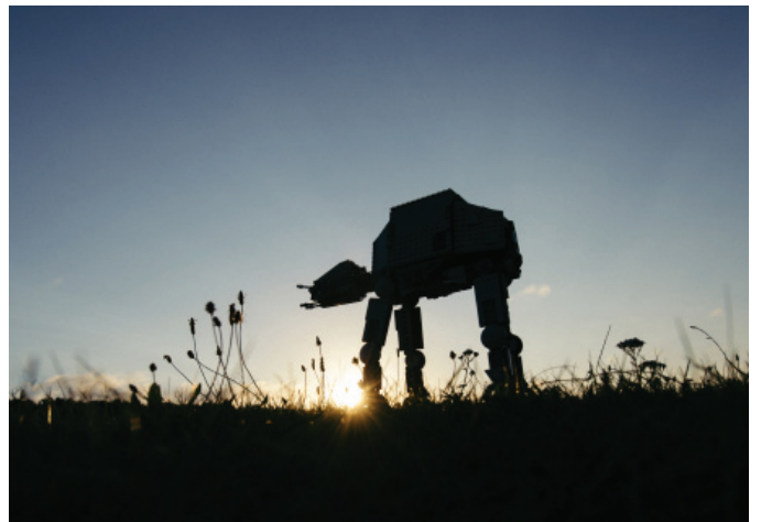
The Morning After