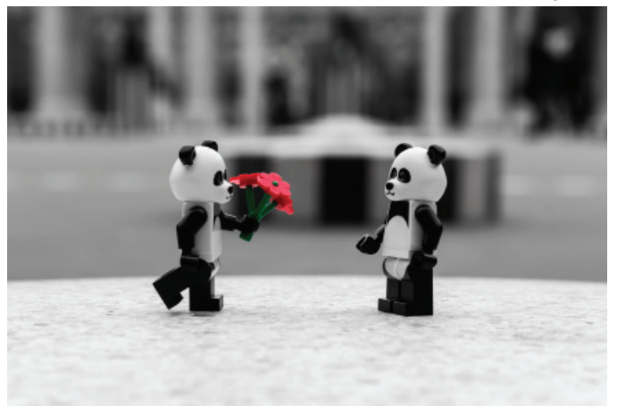
Panda Love by Ballou34