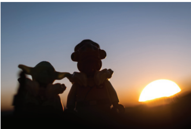
To The Lofoten Islands and Back Again by Reiterlied