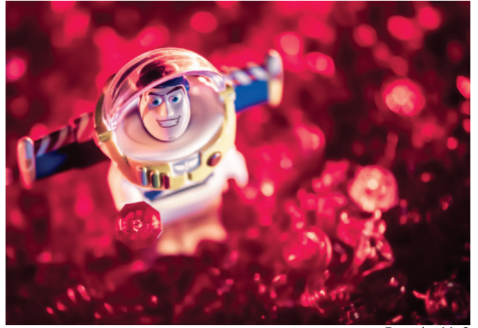
Buzz by Me2