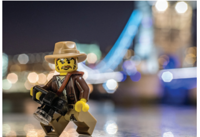
London by Reiterlied