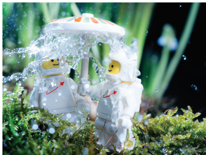
Planet Spring by Me2

Following another successful fine art exhibition in Seattle in late 2015, the collective was recognized in 2016 by the LEGO® Group as an active contributor to promoting LEGO® toy photography and received the RLFM status (Recognized LEGO® Fan Media). Being recognized by the LEGO® group in this way triggered for the collective the question of creative independency, and the second half of 2016 has been a turbulent one for the collective with some members leaving to explore their own artistic path and other new members joining. So at the beginning of 2017 Stuck In Plastic decided to go acoustic.