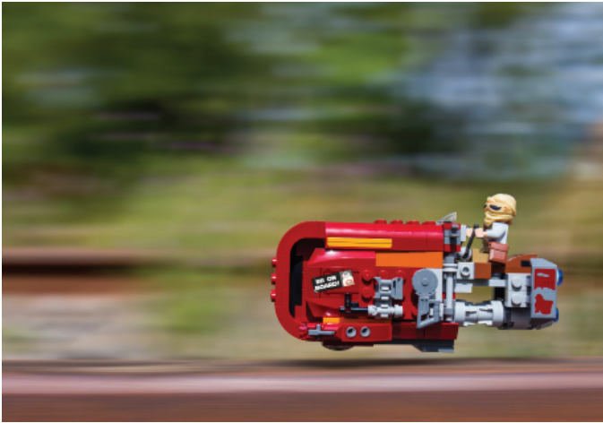
Rey's Speeder by Ballou34