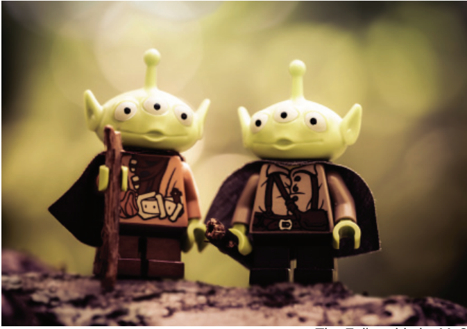
The Fellowship by Me2