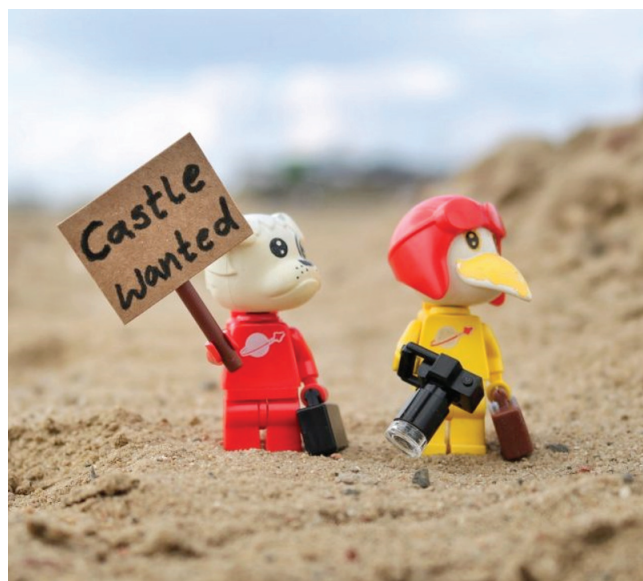
Do you want to join us in Scotland? It is free and great fun!