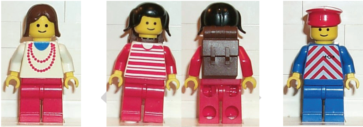
Some minifigures of the set 4554

The set has eight minifigures, which for the size of the set may look like enough, but there are certainly none to spare. It must be remembered that in those years the minifigures all had the same face – the standard smiling face – so the character and personality were entirely given by the torso and what covered their heads. Those were good times... There is the chef, who is in charge of the station's coffee shop, three passengers (the man with the briefcase, the girl with a backpack and those curious pigtails, and the woman with a necklace), and four station employees (two operators with red striped torsos, a sales clerk, and the station manager).