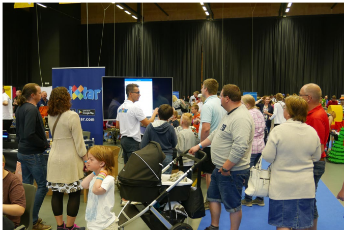
Klossfestivalen in July

HBM: Who builds most, what do you prefer building, and what are two tips for new BriXtar members?