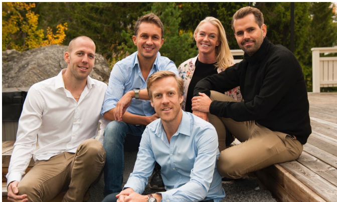
The BriXtar team

BX: Actually quite big – maybe 40-50 people. We have worked closely for the last year and a half with many people from the Swedish AFOL community and even from abroad to help us build BriXtar. So of course we see them as a part of the BriXtar team. But if you look at fully employed staff and advisors we count nine people.