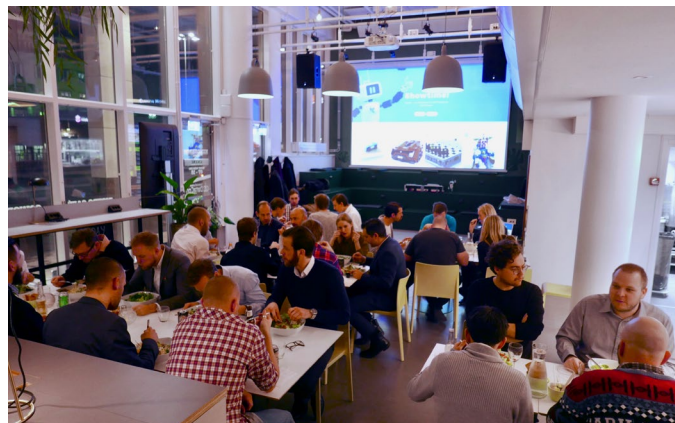
Release Party in November

BX: We see people of all ages using BriXtar and we have had great feedback from users regarding the user experience and members decide who they want to follow. But the most important thing for us is to make BriXtar safe for children, which we have done with a special child account for children under 13 years. Our next goal is to attract more female AFOLs to BriXtar – there are so many talented female builders out there.