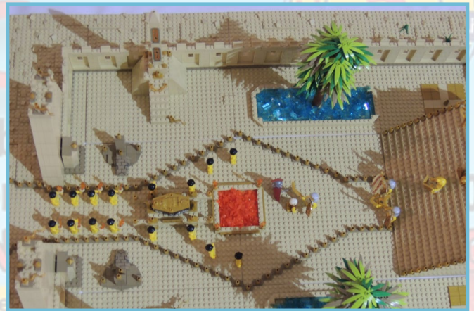
(con tessera alla mano)