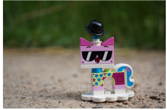
Dashing in Paris – by Nutelasabe

For SiP goes Paris 2018, I had a tour of Paris prepared on paper. Everyday, we would go to different places in the city and reach them either by foot or public transportation. Except for the first location of each day (and the dinner, which I booked - see below), no specific time was planned. That way, if people liked one place in particular, we could spend hours there without feeling rushed for time.