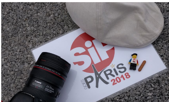
Ready for a great toy photo safari - by Ballou34

For this edition, which we have called 'SiP goes Paris 2018' [2], 20 people from seven countries (Czech Republic, England, Finland, Germany, Sweden, Turkey and France) came to Paris. We spent three full days and walked around 50 km, taking thousands of pictures with hundreds of LEGO® minifigures (and a few other toys).