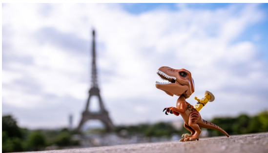
T-Rapped in Paris – by Reiterlied

So if you are planning a meet-up on a day, organize lunch in a restaurant, and if you plan one taking place over several days, you can pick up sandwiches for midday and have dinner in restaurants. It will be a great time to chat and socialize with your fellow photographers. So pick a good restaurant and people will be happy.