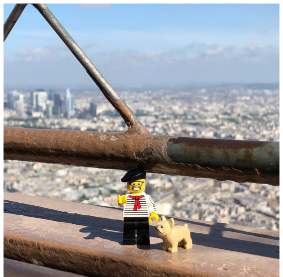
Too much wind – by LEGO__fun

It's interesting because when you come back to these places with friends you discover them from another angle, another point of view. Even though we all spend time in the same location, we won't all use it the same way and that's very instructive.