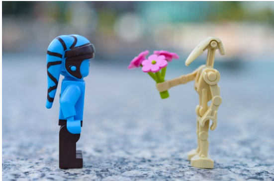
Making friends

One thing we like to do during our toy safaris is the print exchange. The idea is simple. You bring prints to give to others and in exchange you will receive the gift of prints from everyone else. It's a great time. It does get a bit messy when the prints from everyone are moving around the table but you will leave with great souvenirs. I love it. Personally, after a toy safari I will bring these prints back to my office and hang them on the wall. It's a living wall growing like a disease at work. A lot of colleagues are coming to my office, just to check out the new additions.