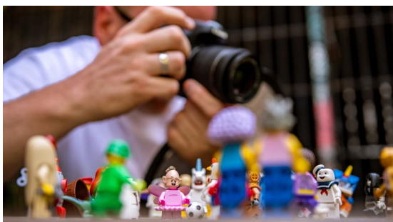
The soccer match

For this toy photo safari, we improvised a big football match (that's 'soccer' for our friends on the other side of the pond). Everyone put some minifigs around in a sports event and we took pictures of them. It's funny to see how we all framed this match differently. It shows how collaboration is something really fun to explore during toy photo safaris.