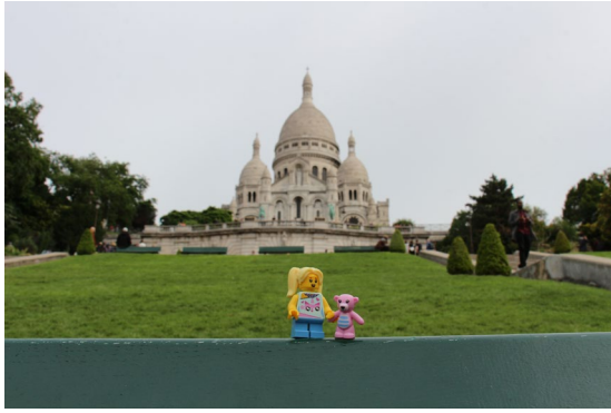
Sacré Cœur – by Lolitabrick