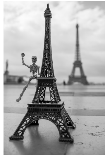
The little world of Paris – by Eatmybones

In the end, with all the preparation you can put in, the best thing to do is to have fun. It's ok if you have to improvise. Some events that you did not plan will occur during the weekend, and you will just have to roll with it.