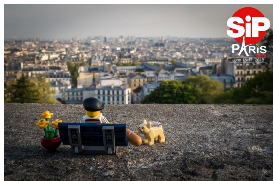
Welcome to Paris

In our case, I used a picture that I took on the heights of Paris and I even created a logo corresponding to the hashtag of our safari #SiPgoesParis2018.