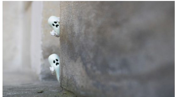
The ghosts of the Louvre – by HerrSM

Stuck In Plastic, organize international meets, but you can also organize a local meet-up in your area. So, let me share with you some tips I learned to make your own toy photo safari a great one.