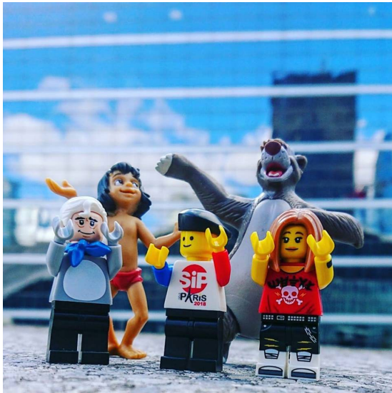
Happy together – by Mickebg

Despite spending time together taking pictures, photography is a solitary pastime. Indeed, although it is great to collaborate with other toy photographers on pictures, most of the time you are in your own bubble, creating stories. So it is important to have some social time together when taking breaks. And lunch and dinner are the perfect moments.