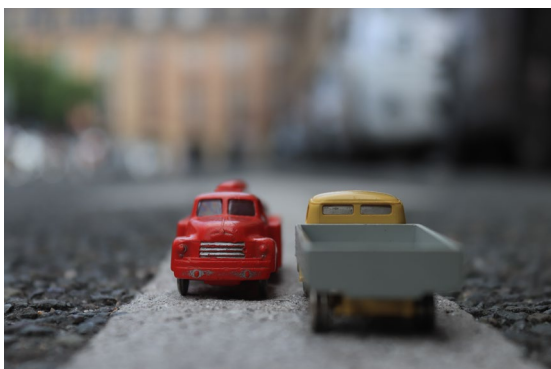
Vroom vroom – by Pulup

Another thing we did on a previous toy safari was the “One toy to share” ( https://www.stuckinplastic.com/2017/10/one-toy-to-share-in-scotland/ ). For that, we brought one toy and everyone had to take a picture of it during the weekend. It's fun to see how we all used it in a different way with our own style. It's a good exercise that we need to try again next time.