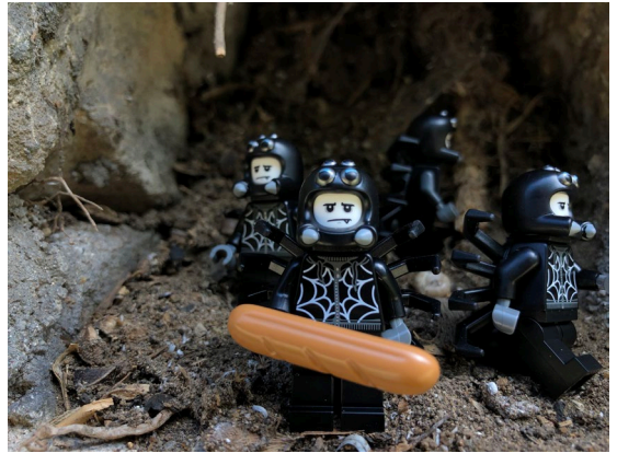
French spiders – by Fubiken

I brought everyone to the famous landmarks in Paris (the Eiffel tower, Notre Dame Cathedral, The Louvre pyramid, the Sacré Coeur) but I also wanted to share some lesser known places where I like to take pictures (a cemetery in Montmartre, some abandoned train tracks, and several parks and gardens).