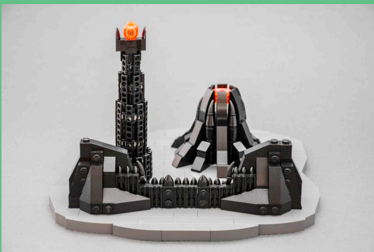
Mordor (August 2017)