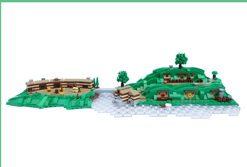
Hobbiton (August 2017)

PB: The release of the LEGO® Lord of the Rings line in 2012 was the main reason why I started buying LEGO® sets again after my dark ages. In the beginning I only wanted to collect the sets and minifigures, but I wasn't interested in building my own creations. Everything changed 2014, when it became clear that LEGO® won't release more Lord of the Rings and Hobbit sets. Due to the fact that so many locations from that movie/book didn't become a set, I decided to build that them with my own bricks.