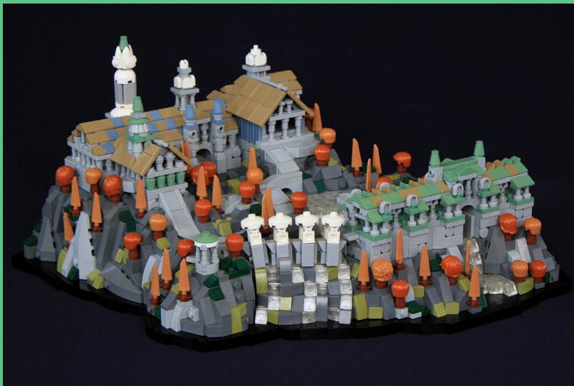
Rivendell (August 2017)

IS: I come from a large family, and my older brothers played with LEGO® a fair bit growing up. Their LEGO® collection was passed down to me and my other brothers, and we played a lot making our creations as kids. In 2011 I was looking up castles online and found the website classic-castle.com . The amazing fan models showcased there inspired me, and ever since I've been actively involved with the online LEGO® community and making original models.