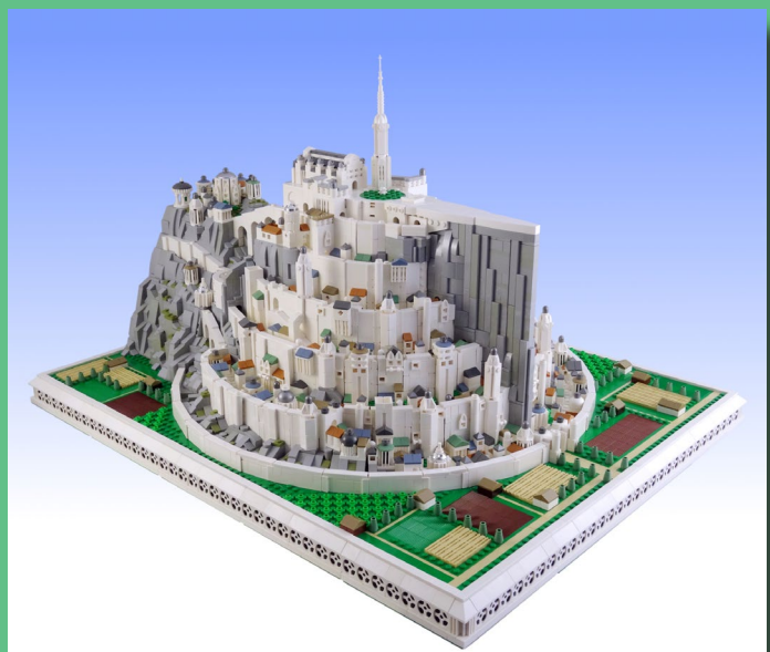
Minas Tirith (June 2018)