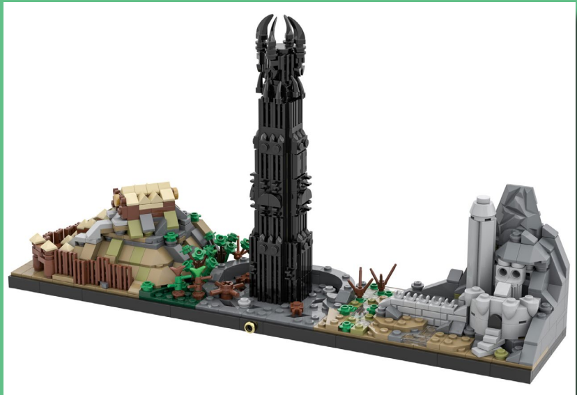
The Lord of the Rings: The Two Towers Skyline (September 2019)

BBL: The original Star Wars sets back in 1999 got me hooked!