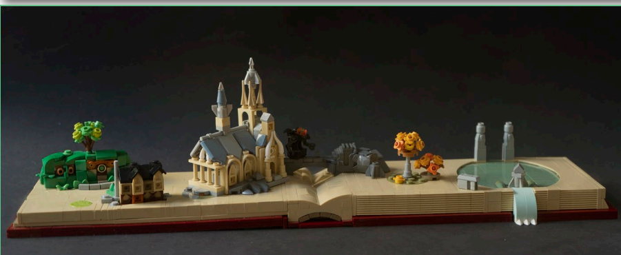
The Fellowship of the Ring (December 2019)