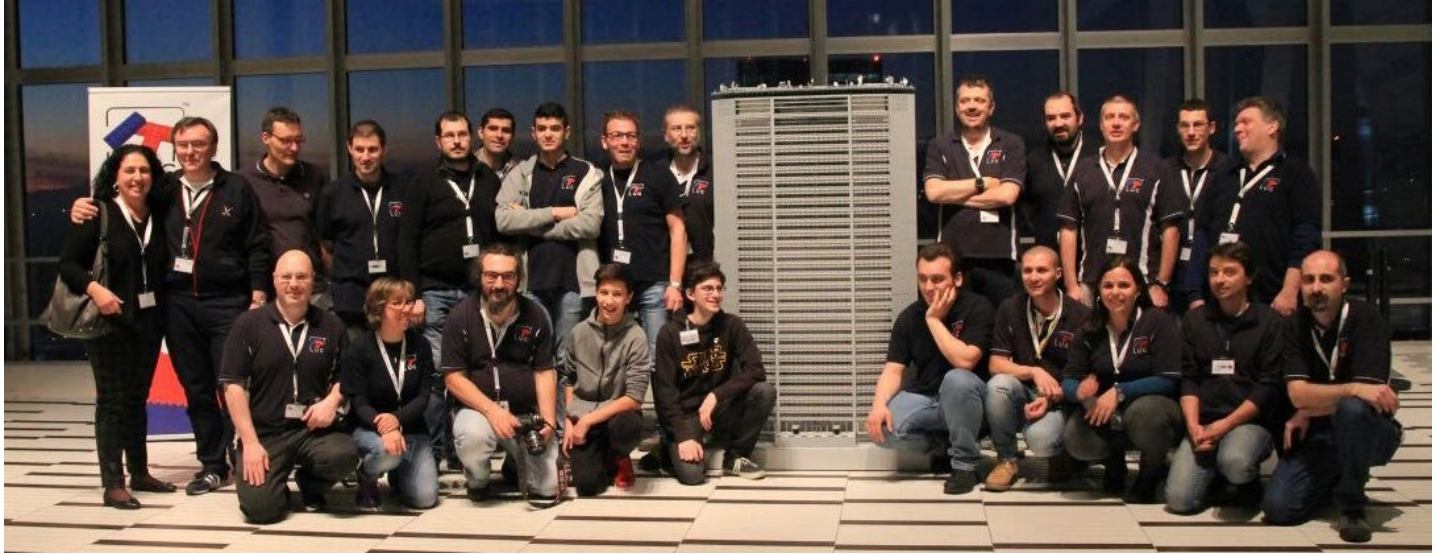
ItLUG members around "Il Pirellone", a LUG community project

that's elected every three years and is composed of seven members: the president, vice-president, treasurer, secretary and three regular members. Of course not all of these 450 people are active, but many of them are. Some organize events, some participate in events, some write on the forum, and some help in other ways. We intend to continue organizing events (well, after COVID-19) and promoting the LEGO brick in any way that we can.