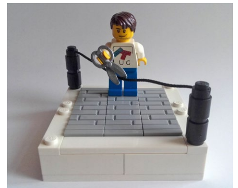
"Io taglierei la corda"