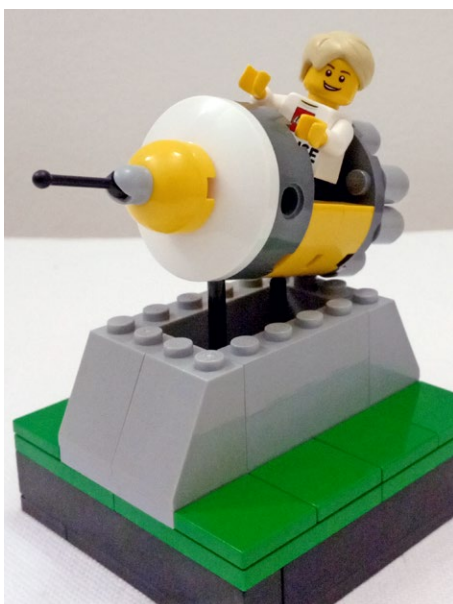
"Giostrina", by FiveCraft