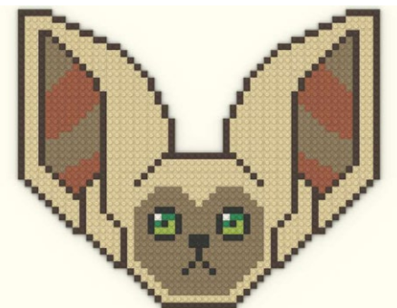
A mosaic of Momo, a character from Avatar The Last Airbender

My primary channel is https://twitch.tv/misstapkat , although I also have a Link tree that condenses a lot of my platforms in one link ( https://linktr.ee/misstapkat )