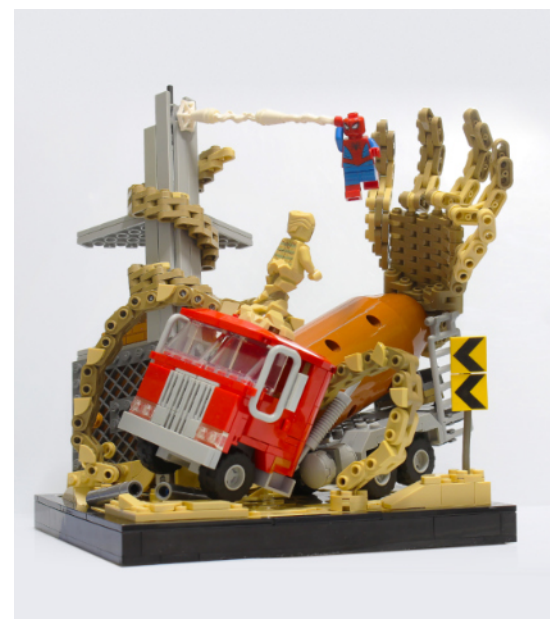
Counterclockwise from top: LEGO Ideas submission, single figure diorama, large Spider-Man diorama.

and things I was assembling. I quite liked it and that led me to start setting up scenery to take pictures of minifigures, mostly Star Wars.