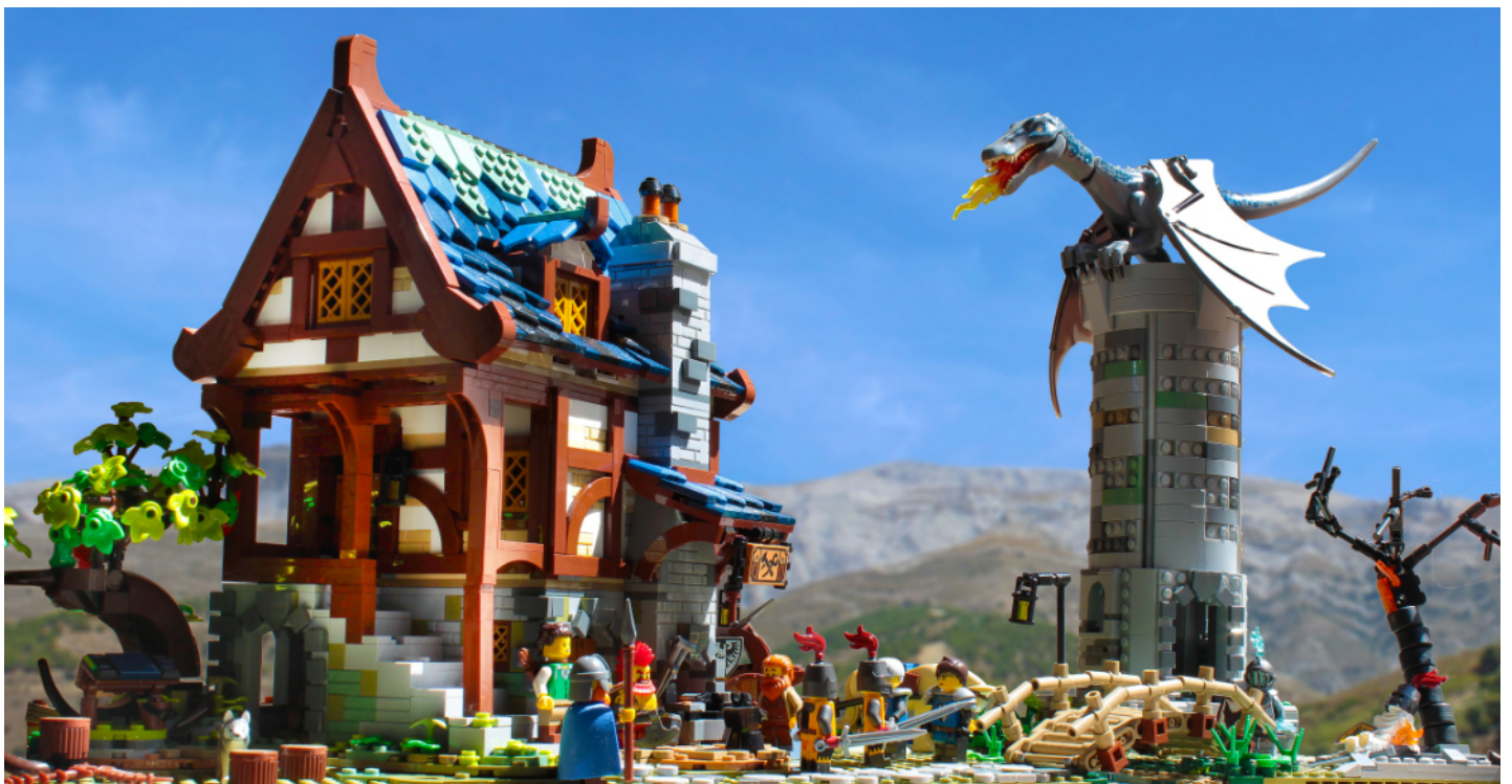
Top to bottom: Naboo fighter in UCS style, Iron Man armor, Obi Wan vs Anakin Duel on Mustafar, MOC based on the new 21325 Medieval Blacksmith set.